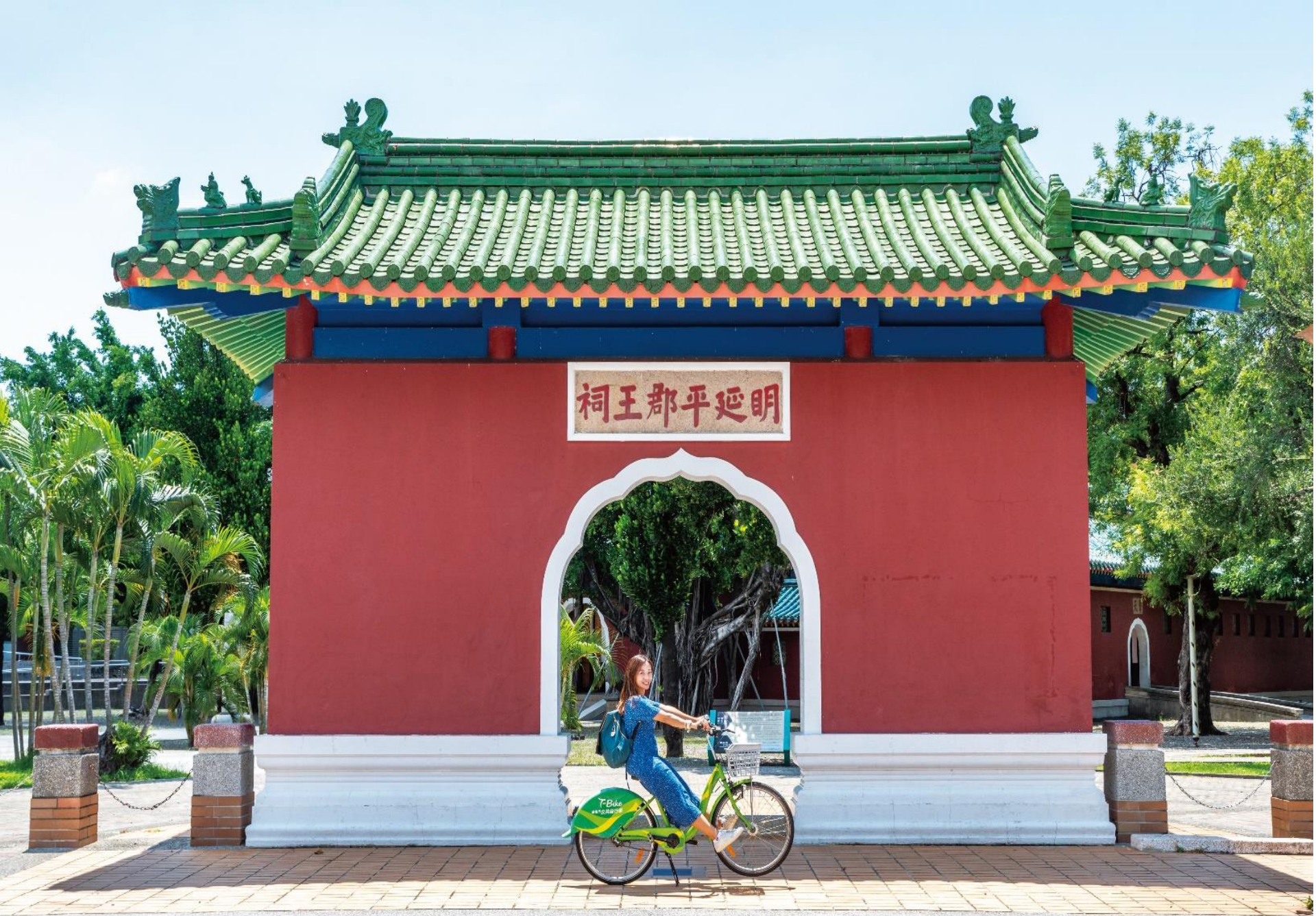
Tainan city bike Path