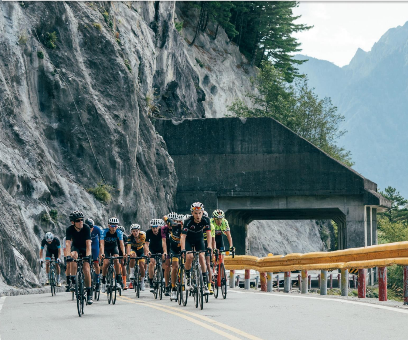
Taroko Gorge National Park