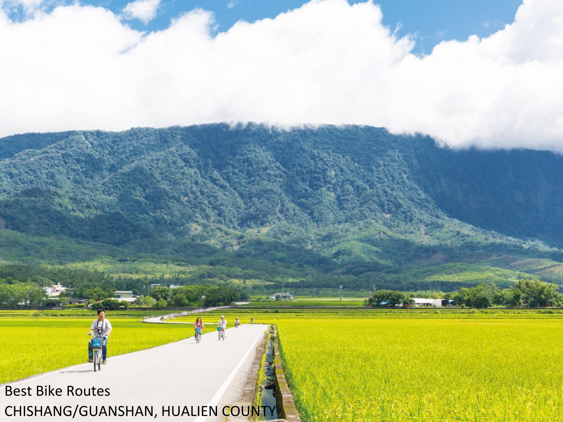
Best Bike Routes CHISHANG/GUANSHAN, HUALIEN COUNTY